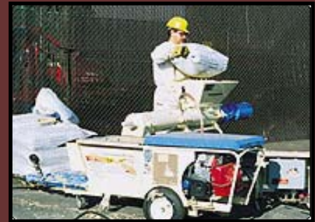
Here's a sprayer used for DMS!

Genesis DMSpray is a newer product carried by Dakota Wall Systems that can really save time. This adhesive & basecoat is extremely easy to use. Although it's created for spray application, it can also be used for non-spray applications, for example, adhering foam to the substrate and doing detail work. Genesis DMSpray is great to use in hot weather because it's formulated to have a longer pot life, less false set, extended open time and stronger wet grip. Whether you're spraying or trowling, come in to your local Dakota Wall Systems office and give Genesis DMSpray a try!